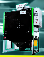
TI-STB-2C SAND REMOVAL TANKBLAST

Safety functions for operator safety A safety light curtain that detects humans.