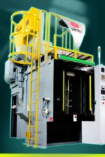
TI-SNBX-II APRON BLAST