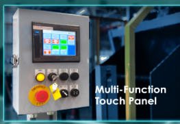
Multi-Function Touch Panel

Rotary drum with vertical vibration mechanism Our unique drum design improves performance. Adding vertical vibration to the conventional rotation multiplies the stirring effect and allows uniform finishing in less time.