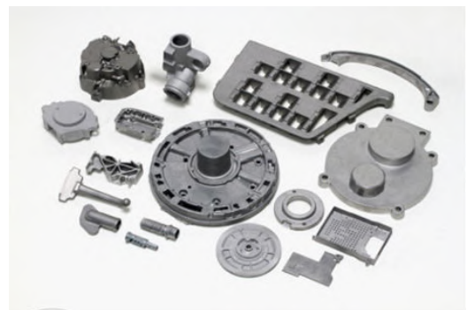
Samples of work piece