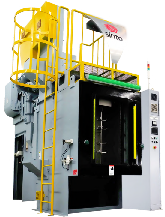
TI-SHB-II-AL ALUMI-BLAST HANGER)APPLICATION)FOR ALUMINUM)DIE-CASTING

While running, GREEN LED lighting will illuminate so operator can easily see from afar and when the light is off it means the machine is ready for next cycle start.