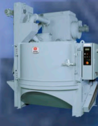
SNTX-II TABLE BLAST