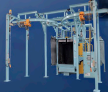
KSB 10 Y Y-TYPE IMPELLER 2 UNITS