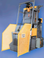
SNB SERIES CLEARLINE DRUM BLAST