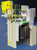
TI-SHB-II-AL ALUMI - BLAST