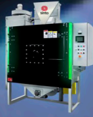
TI-STB-2C (SAND REMOVAL) TANKBLAST