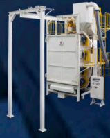
KSB 25 Y Y-TYPE IMPELLER 4 UNITS