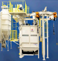
KSB 10 L L-TYPE IMPELLER 3 UNITS